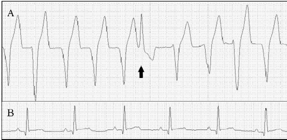
Figure 1. ECG record of dog n° 1 on day two (A) and day four (B) after blunt thoracic trauma. On "A": sustained ventricular tachycardia with R-on-T phenomenon (arrow). On "B": sinus rhythm following anti-arrhythmic therapy. Lead DII, 50mm/s.