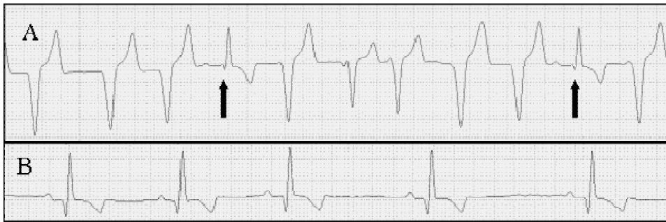
Figure 2. ECG record of dog n° 2 on day two (A) and day nine (B) after blunt thoracic trauma. On "A": ventricular tachycardia with sinus capture beats (arrows). On "B", sinus rhythm with complete resolution of arrhythmias. Lead DII, 50mm/s.