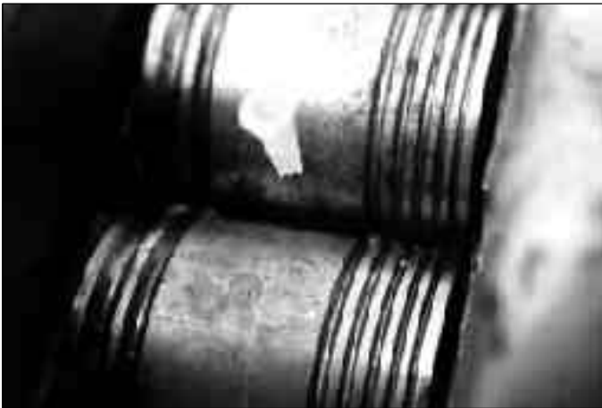
Fig. 2 – Grasping a needle between two metal roller (laminator)