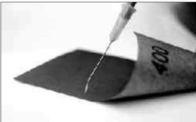
Fig. 3 – Sandpaper is used to rough and round the produced tip