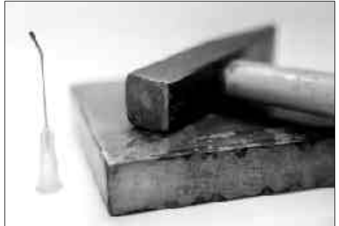
Fig. 4 – Alternative way to produce the instrument, using a hammer and a flat metal surface