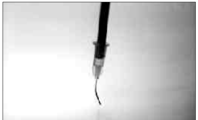
Fig. 6 – Instrument flexibility under applied low pressure