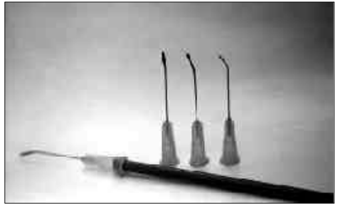
Fig. 5 – Manufacturing process (from right to left), from the cannula, through square-sharp, and rough design, until the mounted instrument