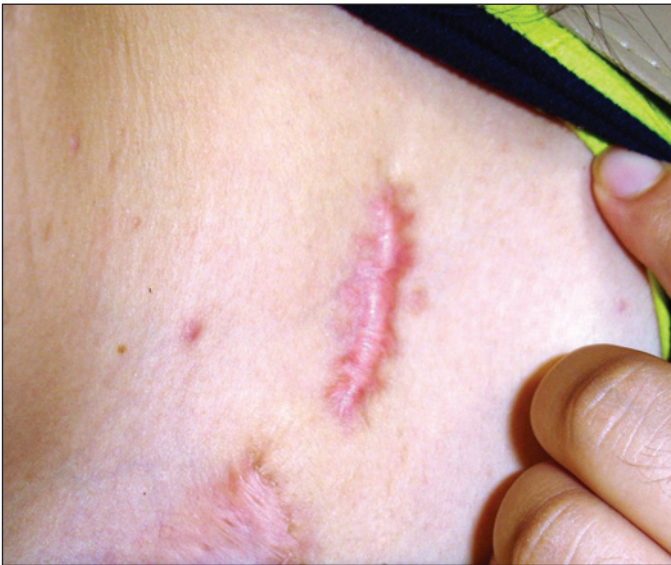
Figure 3 - Donor site hypertrophic scar

niques for cicatricial ectropion correction such as flap rotation or sub orbicularis oculi fat (SOOF) lift were not suitable in this case because of the extensive scarring around the inferior eyelid. The risks and benefits of the intervention must be discussed with the patient before surgery.