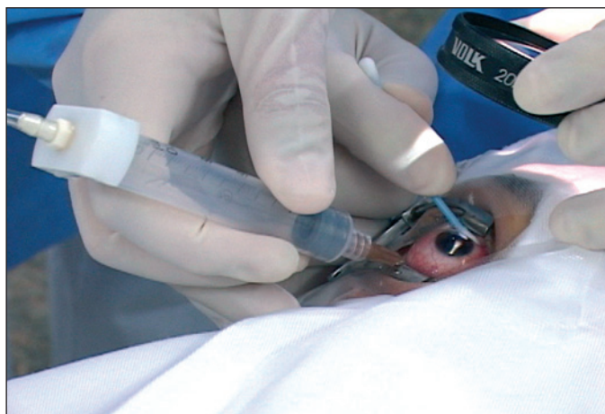
Figure 1 - Transconjunctival retinopexy. An external photograph showing monitoring of subretinal fluid drainage, after needle insertion through the sclera.

Clinical characteristics of the study population and study results are summarized in table 1. The mean follow-up duration