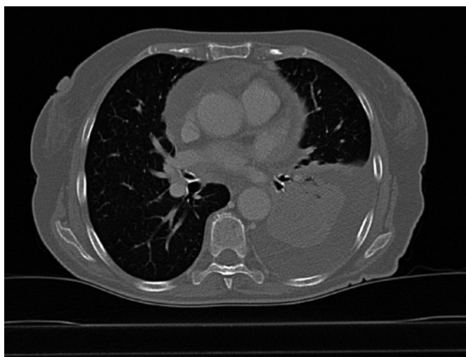
Figure 2. Computer tomography features of the lesions in the lung showing small nodules and pleural effusion.

explanation (1) . The other frequent sites of choroidal metastasis are alimentary tract cancers, prostate, skin melanoma, kidneys, contralateral choroidal melanoma, thyroid and testis (5) .