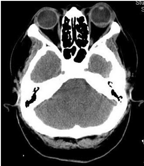
Figure 1. CT scan of the patient showing a transscleral mass on the left eye.