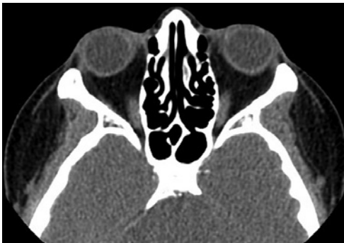
Figure 4. Normal orbital CT scan of the patient 10 weeks after treatment.

patient had a positive result for the purified protein derivative (PPD) skin test (17 mm induration under corticotherapy 80 mg/day) and interferon-gamma release assay (IGRA), which is a more specific test. Antitubercular chemotherapy was started in combination with the oral corticosteroids, and was a combination of rifampicin 10 mg/kg, isoniazid 5 mg/kg, and pyrazinamide 25 mg/kg. The oral prednisolone treatment was given for 10 weeks, and the antitubercular therapy for 9 months. After 10 weeks of treatment, the patient recovered a visual acuity of 6/6 in the left eye, the optic disc edema and choroidal folds disappeared, and the orbital CT scan (Figure 4) and B-scan ultrasonography were normal. The patient has since remained asymptomatic for a period of 18 months.