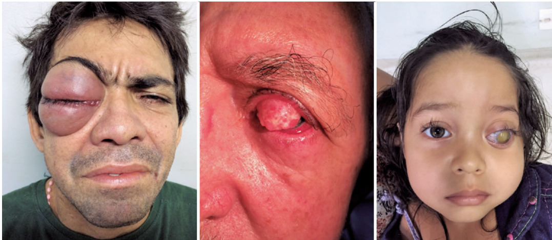
Figure 2. Illustrative cases from the Ocular Oncology Center of Manaus: orbital lymphoma (left), squamous cell carcinoma (center), and retinoblastoma (right).

that most of the population of the state is concentrated in Manaus (52%), with the remaining distributed over a large area and have difficulty in accessing the capital city. Moreover, we would expect that knowledge of our center will take time to reach more geographically isolated areas.