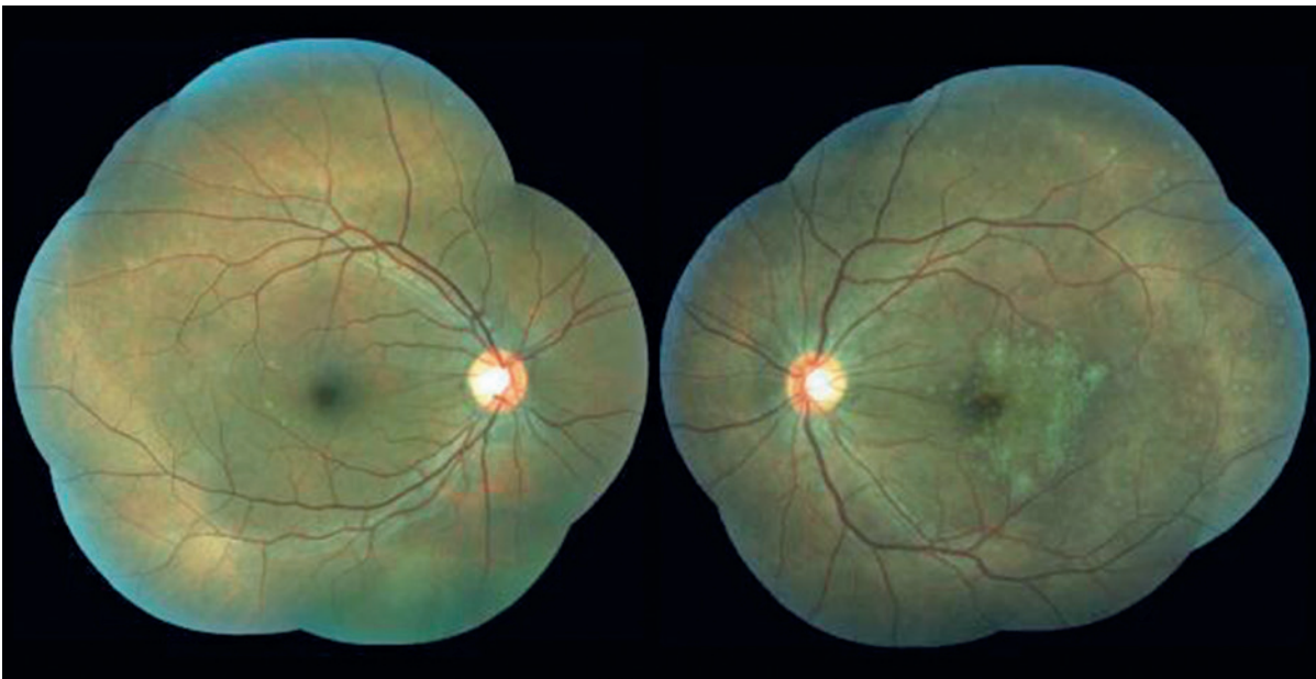
Figure 1. Fundus imaging of right and left eyes.

PIC is a relatively rare idiopathic inflammatory multifocal chorioretinopathy that affects primarily, but not exclusively, young white myopic women. PIC lesions most commonly involve the posterior pole, not being associated with vitreous or anterior chamber inflammation, which is the primary feature differentiating PIC from MCP. The lesions raise at the level of RPE and inner choroid, sometimes being associated with the development of subretinal fibrosis and choroidal neovascu-