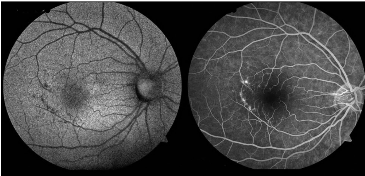
Figure 2. Autofluorescence (left) and fluorescein angiography (right) of the right eye.