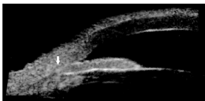
Figure 2. Right eye. Plateau iris configuration: narrow angle (arrow), flat iris, ciliary processes situated anteriorly, and absence of ciliary sulcus.

Serological tests confirmed the presumed diagnosis of dengue infection (positive IgM antibodies for DENV as determined by ELISA). Elective surgery was contraindicated until the thrombocytopenia resolved.