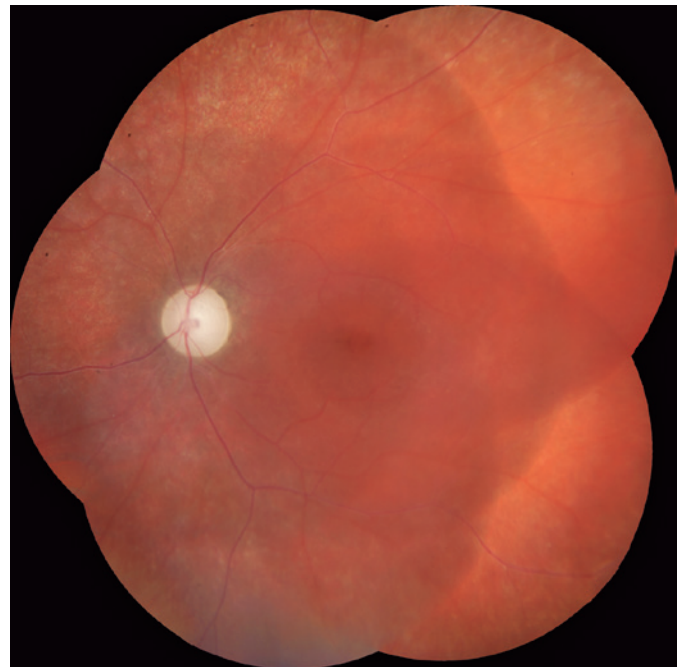
Figures 2. Retinography image (Visucam 524, Carl Zeiss Meditec, Inc, Dublin, CA) of the left eye showing optic disc pallor with large excavation and attenuation of the retinal vessels with no intraretinal pigmentation (bone-spicule deposits). Foveal pigmentary changes and retinal pigment epithelial mottling can be observed in the periphery.