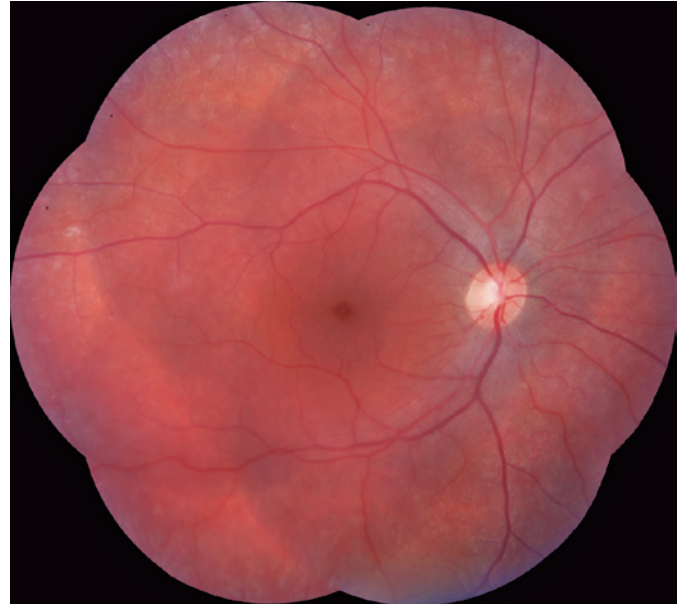
Figures 1. Retinography image (Visucam 524, Carl Zeiss Meditec, Inc, Dublin, CA) showing the right eye with normal optic disc color and excavation with subtle foveal and parafoveal pigmentary changes. Retinal pigment epithelial mottling can be observed in the periphery.

Spectral-domain optical coherence tomography (Spectralis, Heidelberg Engineering GmbH, Heidelberg, Germany) revealed a bilateral cystoid macular edema that was most prominent in the left eye (Figures 3 and 4).