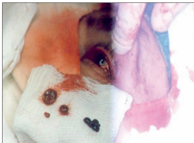
Figure 2 - Pyogenic granuloma removal surgery - showing the pathological material