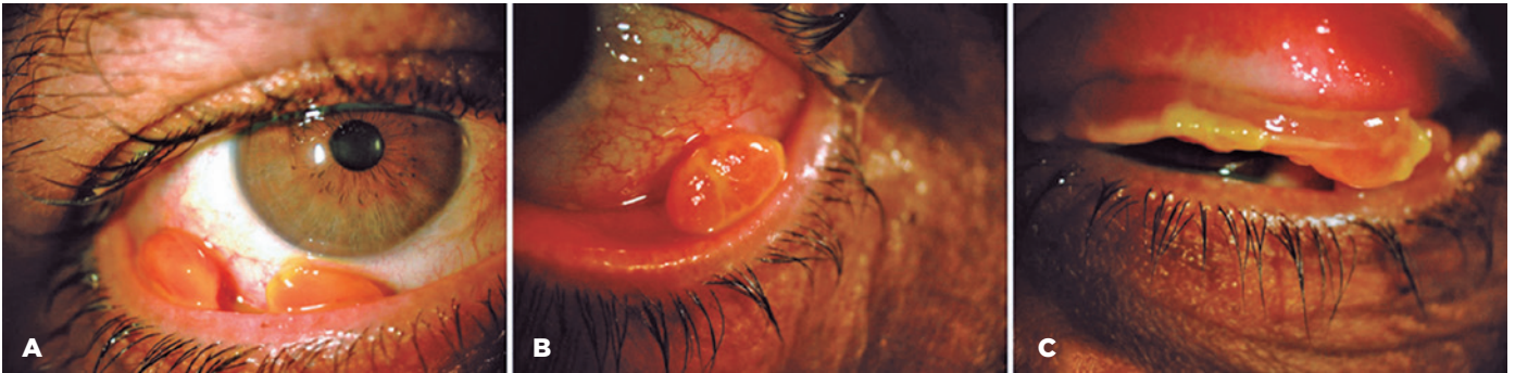
Figure 1. Case 1: Biomicroscopy on admission. (A) and (B) lower tarsal pink, granulomatous aspect, pedunculated masses. (C) OS upper tarsal, thick, and hard membrane.

A 70 years-old female patient was referred for the evaluation of chronic membranous conjunctivitis in the OD refractory to clinical treatment and three surgical