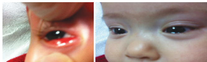
Figure 3. The patient's eyes after treatment.

We referred the patient to a pediatric hematology clinic, and they did not recommend any systemic treatment. Further, we examined the patient daily and recognized new membrane formation on the lower eyelids on the third postoperative day. We decided to use topical FFP as plasminogen concentrates for use as eye drops are not yet commercially available. We then obtained plasma from a O negative donor with a normal plasminogen level. Sterile drop bottles with 3-ml plasma were frozen at -40^{\circ}\text{C} , and each bottle was thawed for daily use and refrigerated at 4^{\circ}\text{C} for 24 h. The topical FFP eye drops were used 6 times daily for 6 weeks; no recurrence was observed during this period. Furthermore, the patient's parents abruptly discontinued the treatment. On the 15th day after the treatment discontinuation, the patient presented to our clinic with bilateral ligneous conjunctivitis. We treated her with topical FFP 6 times daily, netilmicin and collyrium (SIFI S.P.A, Italy) 4 times daily, and topical dexamethasone ointment (Alcon Couvreur, Belgian) 2 times daily for 1 week. The treatment was then continued with only topical FFP 6 times daily. No recurrence was observed during the 3-month follow-up period (Figure 3).