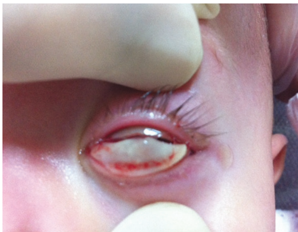
Figure 1. Conjunctival membranes on the lower and upper eyelids in the patient with ligneous conjunctivitis before treatment.