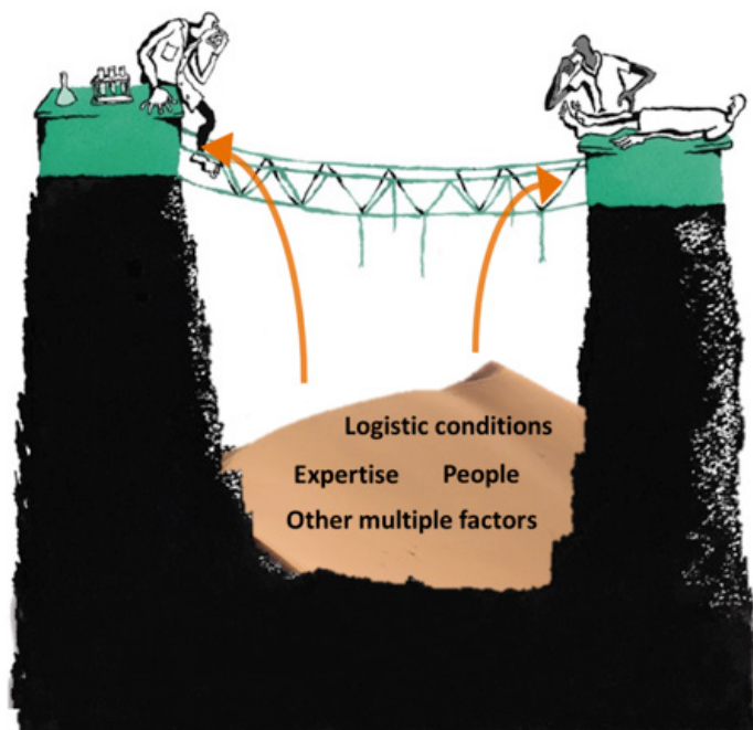
FIGURE 3 - Gap existing between clinical and basic research. Adapted and modified from Nature 1 .

As mentioned by Elias Zerhouni 1 , there used to be a widening gap between basic and clinical research, representing the gap existing between one modality of investigation and the other. It is necessary to have the ability to coexist or to walk on an imaginary bridge with skills in terms of the formation of groups of people with the expertise necessary for success, (Figure 3). The approximation of basic to clinical research or vice versa can occur in a rational manner by joining together laboratories, basic areas and clinical areas of different departments of the same institution or of the same university, or even of different universities. This permits the pooling of excellence in terms of human and financial resources for a better and more rational development of technology in order to favor a better solution of problems on the one hand and better functionality of the laboratories on the other.