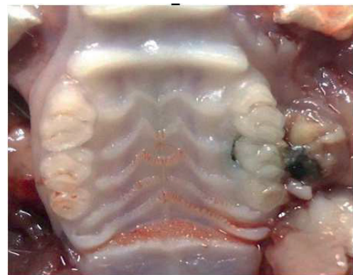
FIGURE 1 – Oral cavity of the animal with the ligature.