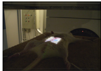
FIGURE 1 – Irradiation field illuminated.

The anesthetic procedure used ketamine hydrochloride (Ketalar ® ) at a dose of 10 mg/kg and the sedative, analgesic and muscle relaxant 2-(2,6-xylylidine)-5,6-dihydro-4H-1,3-thiazine hydrochloride (Rompun ® ) at a dose of 0.1 mg/kg, and was uniform to all the animals. After anesthesia, irradiation was administered with the animal in a supine position. The field to be irradiated was determined at a distance of at least 50 mm from the genitalia, by means of illuminating the area (Figure 1).