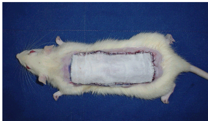
FIGURE 1 - Rayon bandage containing capsaicin or inert vehicle placed on the skin flap

Statistical analysis was performed using Student's t-test at a significance level of 5% ( p \leq 0.05 ).