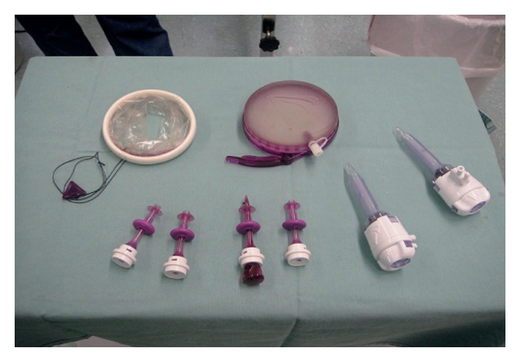
FIGURE 1 - GelPoint® and its trocars.

Hence there is an expectation that GelPoint® may be an alternative for renal surgeries, the current study aims to evaluate partial and total nephrectomy in an experimental model (pigs). The aims of this work consist on analyzing the use of this new surgical instrument in two different surgical techniques and also describe the difficulties found in the proposed procedure.