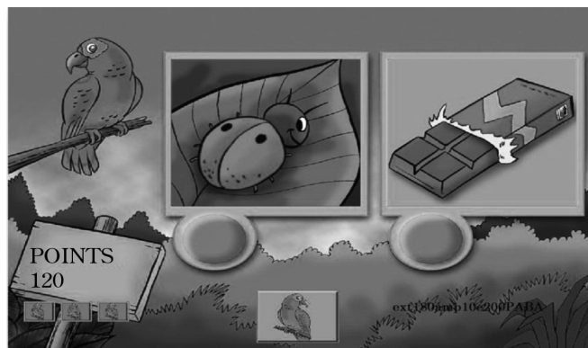
Figure 3. Verbal discrimination and sequencing

assessment and reassessment); percentage correct responses in frequency and duration tests (initial assessment and reassessment); points scored on the reading protocol (initial assessment and reassessment); points scored on phonological awareness test (CONFIAS) (initial assessment and reassessment).