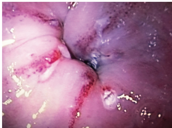
FIGURE 3. Endoscopic view of esophagus post procedure.

procedure is repeated systematically every 0.5 cm in the direction of the Z line and at its level. After completion of the esophageal treatment, the catheter is advanced into the stomach and the balloon is inflated to 25 mL and pulled against the cardia for additional cycles of RF, now with two more 30-degree rotations. These steps are repeated by inflating the balloon to 20 mL. Upon completion of this procedure, an additional upper endoscopy is performed to exclude complications and assess the created lesions (FIGURES 3 and 4). In the three cases presented below, postoperative control exams were not performed due to the short follow-up time.