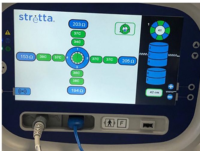
FIGURE 2. Generator of radiofrequency.

The balloon is positioned 1 cm above the Z line and is inflated to 25 mL, the needles are deployed within the tissue, and the first command is given by depressing a foot pedal. Each RF treatment lasts approximately 60-90 seconds. After RF is delivered at each level, the needles are withdrawn, and the balloon is deflated. The catheter is then rotated 45 degrees clockwise at the same level and the process is repeated to complete the first cycle of treatment. This