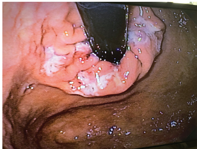
FIGURE 4. Retroflex vision of gastric junction post procedure.