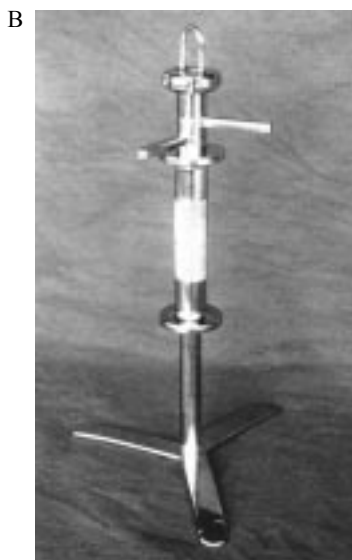
FIGURE 1B – Internal part – the support with three turning rods

The analytical system of these situations was a classification in terms of there being any influence on the surgical procedure or not. This influence could be favourable or unfavourable; in the latter case, interference could be small, moderate or severe depending on the need for some maneuver of a specific nature or uncommon in pneumoperitoneal surgery.