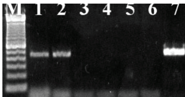
Figure 1. Amplification by nested polymerase chain reaction of BoHV-1 in supernatant of MDBK cells co-cultured with oocytes pre-cultured with uterine epithelial cells pre-inoculated with BoHV-1 (Experiment 2). M: weight molecular markers; 1: oocytes treated with trypsin; 2: oocytes submitted to sequential washes; 3: control (sequential washes); 4: supernatant of non-infected uterine epithelial cells culture; 5 and 6: negative controls (water); 7: positive control (BoHV-1 from MDBK cells).

The monolayers of bovine epithelial cells (BOEC) that co-cultured with in vitro matured oocytes pre-infected with BoHV-1, washed or not with trypsin, showed CPE. The CPE from trypsin treatment was less intense. The BOEC control did not present CPE. The n-PCR was positive for the samples that showed CPE and negative for the samples without CPE (Fig. 2).