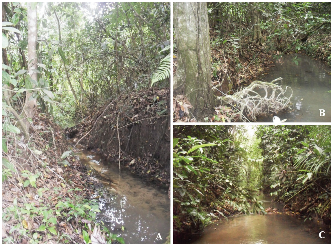
Figure 1. Images of the three blocks A, B and C, respectively, sampled during rainy season in May, 2013 at the stream Saltinho of the Biological Reserve of Saltinho, Tamandare city – Pernambuco, Brazil.