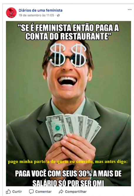
Figure 2 – Post published by the “ Diários de uma feminista ” (Diaries of a feminist) moderator.