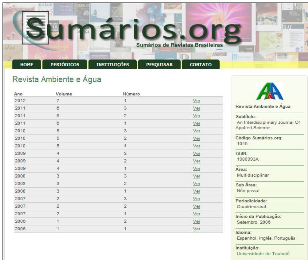
Figure 3. Page extracted from Sumários.org site the published issues of Ambiente & Água that can be downloaded directly from their server.

Figure 3 shows that all volumes and issues can also be accessed from the Sumários.org site.