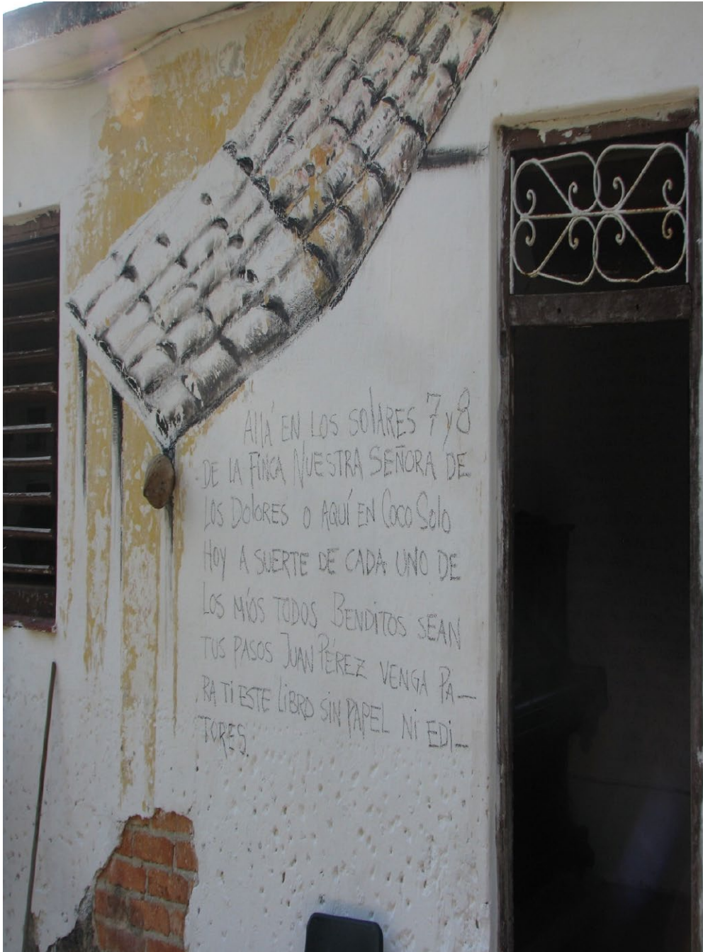
Figure 8 – House-Book.

73. For a short documentary on this project, see: < https://bit.ly/2Yf5OuC >. Access on: Mar. 28, 2020.