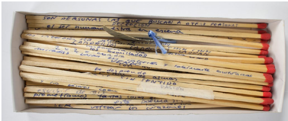
Figure 4 – Cabezas rascan paredes.

Surprisingly, in contrast to careful textual elaboration, the usefulness of the very object is striking, matches industrially created that propose to the reader a performative act: light the poetry, burn the text, reduce it to ashes. There is a strong contrast between the difficult production of the texts and its easy destruction. The hand that writes, it also manipulates the match, the genesis and the death of the text are related to hand movement. The object invites the reader to light the poetry and burn the text.