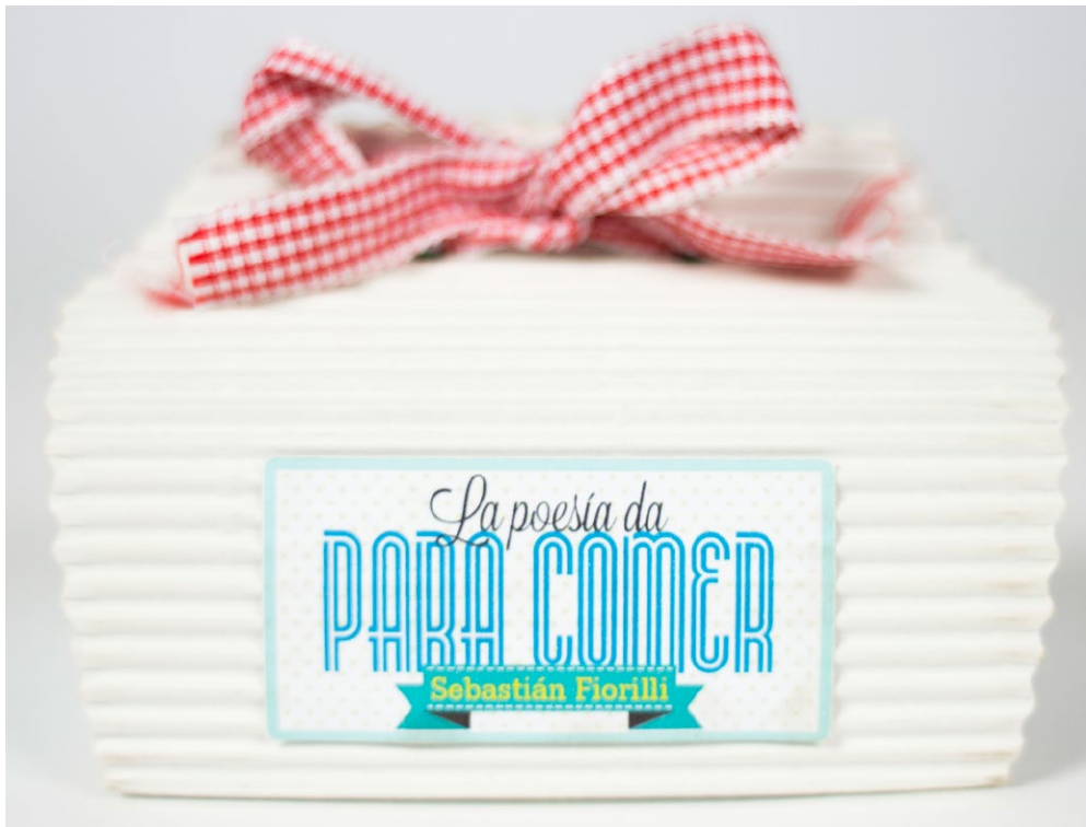
Figure 1 – La poesía da para comer .

These 24 page-wafers are numbered and divided into five blocks that follow an order indicated in the lower right portion of the wafer, so they are not completely autonomous pages. This object-book is also an example of ephemeral art and transitory writing. 36 The wafer, a thin sheet of unleavened bread, is made to be eaten. If the reading process is to mentally digest and meditate in order to understand, this book suggests to physically eat the book: chew it, taste it, swallow it, convert it into an assimilable substance for the organism. The title, Poetry to Eat , suggests ingestion and poetic digestion, the wafer invites the reader to consume it, perhaps in communion. Known as graphophagy , the practice of textual ingestion or consumption has ancient roots, and also an important tradition within the field of object-books. 37 Giorgio Cardona 38 describes graphophagy as a non-linguistic use of texts, and as an old practice considered therapeutic. 39 Cardona offers detailed descriptions of old religious practices in relation to graphophagy, like the one called “written water” among Jews and Muslims. 40 Cardona describes how even today water is used to clean tablets with Koranic verses, or even macerate pieces of paper with Koranic verses and, after the ink dissolves in water, this water is then drunk by believers. 41