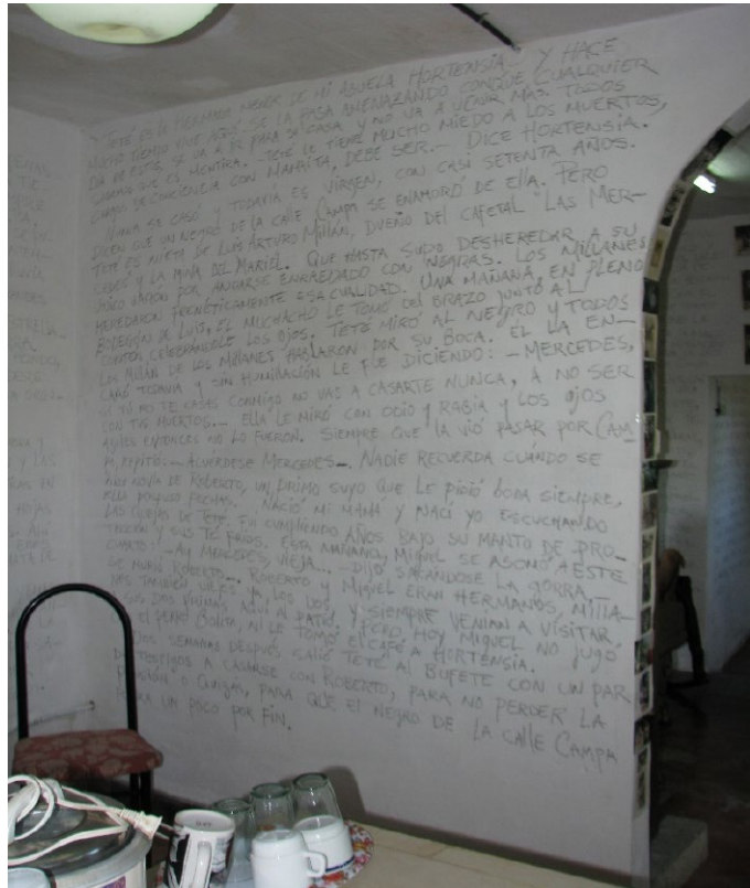
Figure 9 – Kitchen.