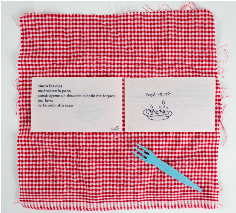
Figure 2 – La poesía da para comer.