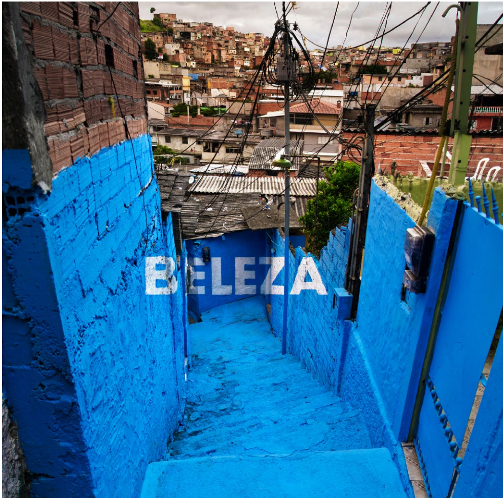
Figure 11 – Beleza / Beauty .

It is meaningful that for the interventions, the members of the community, stigmatized with misery, distress, violence and drugs, chose democratically to print on walls words like “beauty”, “persistence”, “love”, “sweetness”, and “pride”, all of them full of positive connotations. 74 These are meaningful concepts for dwellers that represent their hopes and dreams, these public writings openly question the stigma that these communities face. The interventions were made in busy alleyways of the neighborhood, the words in the walls will be read but the intention is that oral interaction among passers-by will bring those topics –beauty, sweetness, poetry, love, etc.– to regular conversations. Readers will be surprised to find themselves walking through those art interventions. The permanence of those words in the walls of the alleys remember inhabitants and visitors that the meaning of those words also dwells those spaces that they transit. As aforementioned, Roger Chartier 75 supports the idea that sometimes just