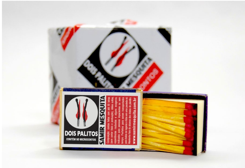
Figure 5 – Dois palitos .

I finally want to mention the Hai-kaixa (see Figure 6) by Marcelo Dolabela, a small matchbox that contains one hundred haikais: 66