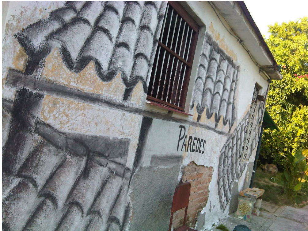
Figure 7 – House-Book.

72. Boa Mistura (2012). São Paulo seems to be an open book as city, not just for the art of graffiti in its streets and avenues, but also for the abundant pichação / pixação or “wall writings” all over the city. For an analysis on pichação in São Paulo as exposed writing, see Pereira (2010, 2016).