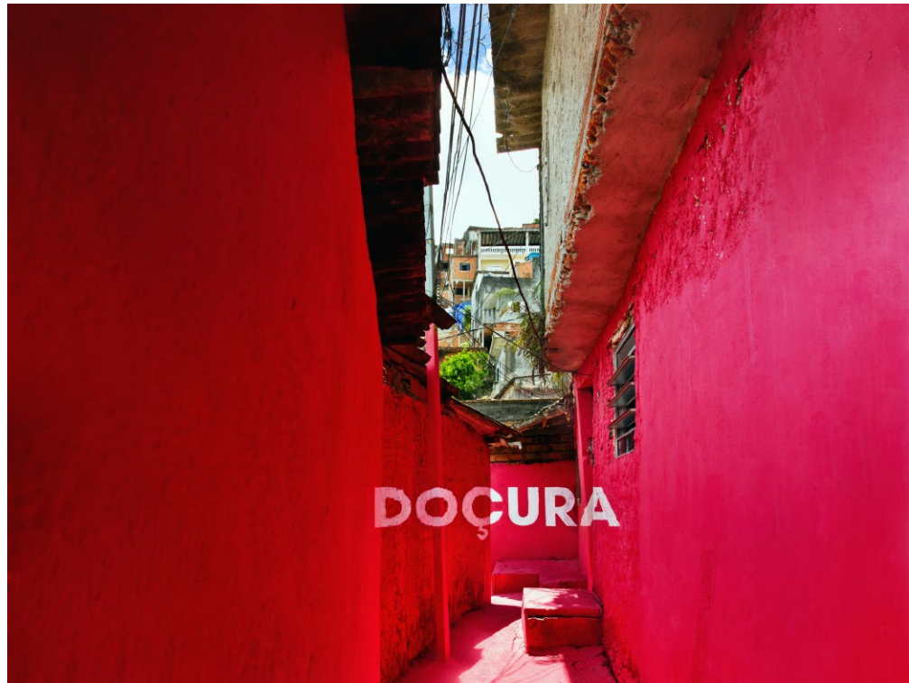
Figure 12 – Doçura / Sweetness . Picture: Boa Mistura.

the intentionality of binding different parts together could be a book, perhaps these alleyways are binding a book that Boa Mistura just only started to write. Further, Boa Mistura explores here a social function and use of writing when they gathered together many members of the community to intervene those spaces.