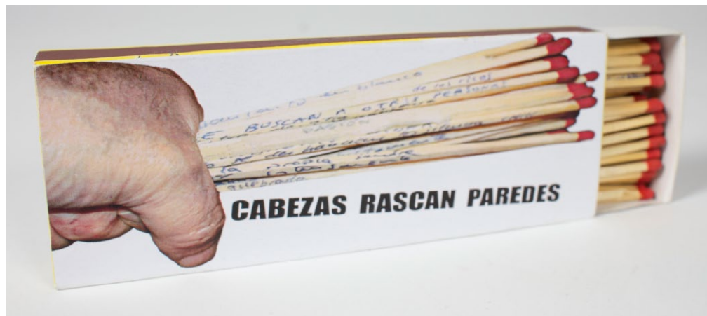
Figure 3 – Cabezas rascan paredes .

Cabezas rascan paredes (Poemas para prender en plena calle) –Heads Scratching Walls (Poems to Light on the Street)– by Julio Fernández Peláez is an object-book made in a matchbox with long matches (see Figure 3). 51 The box, cover and back cover of the book, is a container of 36 handwritten matches or pages that make up the book. On the back cover it is reported that: “ Heads Scratching Walls is a book of poetry written in matches / and it is also a matchbox that contains a book of poems”, 52 therefore, a book that serves as an object and object that is a book. Each one of the 36 matches are materiality that conveys writing.