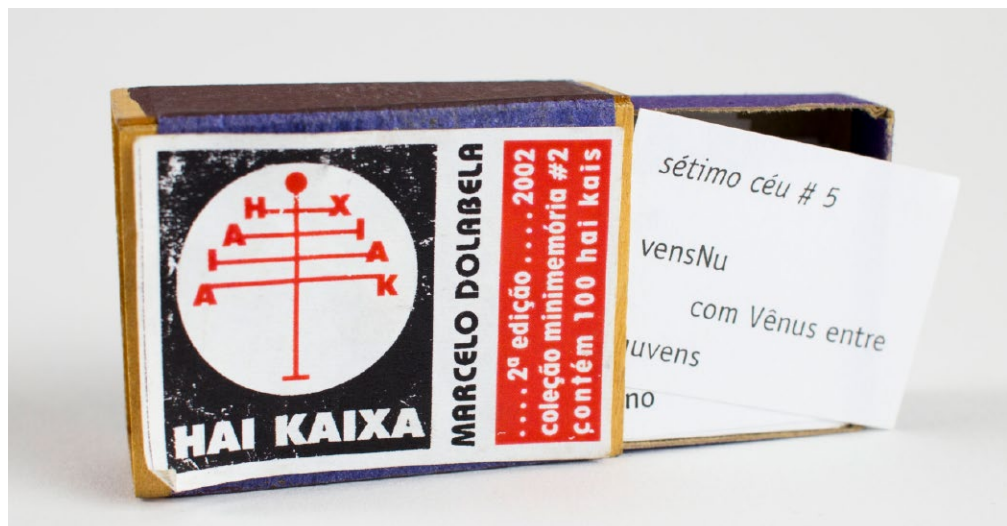
Figure 6 – Hai Kaixa .

I finally want to mention the Hai-kaixa (see Figure 6) by Marcelo Dolabela, a small matchbox that contains one hundred haikais: 66