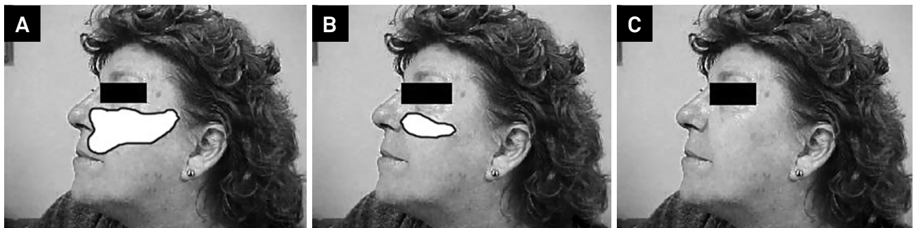
In our previous study 4 , the reduction in pain documented in our patients had a centripetal or shrinking pattern, which would not be expected for a placebo effect. A: before BoNT/A treatment the average pain areas were 2.06 cm 2 , 2.03 cm 2 and 2.85 cm 2 for V 1 , V 2 and V 3 , respectively; B: 10 days after treatment there was a significant reduction in the pain area (1.40 cm 2 ; 1.03 cm 2 and 1.54 cm 2 , respectively); C: patients were almost symptom free 20 to 60 days after treatment (0-0.38 cm 2 , 0.05-0.38 cm 2 , 0-0.56 cm 2 , respectively).