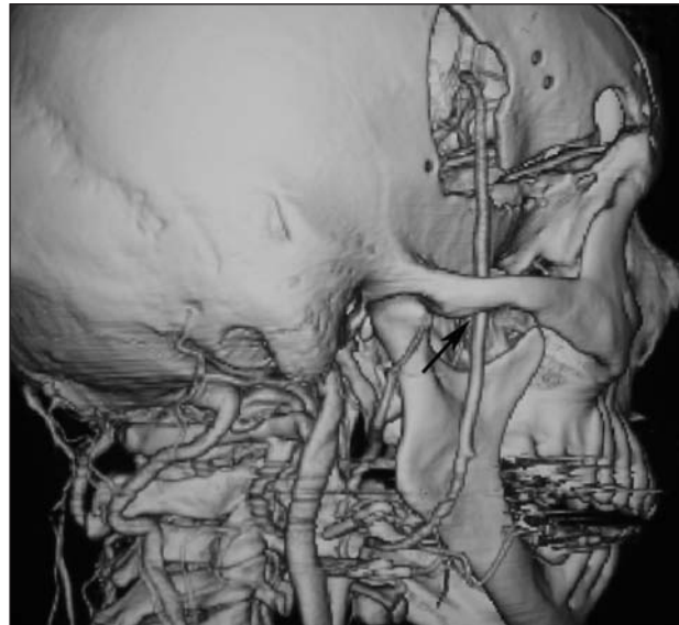
Fig 3. Postoperative angiogram showing the patency of the saphena vein graft. The graft is located underneath the zygomatic arch (arrow) and enters into the cranial cavity through burr holes appropriately located to avoid kinking.

The pathophysiology of stroke is still debated 4,9 . Embolic and hemodynamic mechanisms are implicated as causal factors. Severe atherosclerotic disease of ICA or their intracranial branches may cause reduced perfusion pressure in the distal cerebral circulation. The presence of reduced perfusion pressure (hemodynamic compromise) has long been implicated as a risk factor for ischemic stroke 6 . The relative role of hemodynamic factors