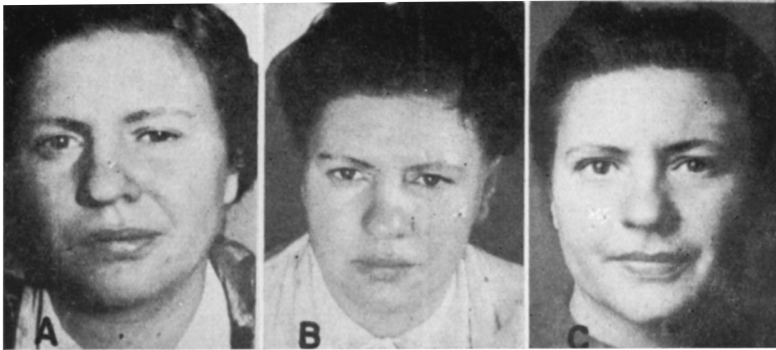
Fig. 1 — A: Bell's palsy of seven months' duration on the left side, with contracture. B: appearance of the patient the day after the operation; the contracture disappeared immediately after decompression without the slightest impairment of the mobility. C: 2½ years after decompression.

My own material consist of 10 cases of hemifacial spasm (7 primary and 3 postparalytic, all women) and one of blepharospasm. The idea of decompression in these cases occurred to me (1943) because I had seen 3 cases of Bell's palsy who had spontaneously made a partial recovery marked by contracture, which disappeared in immediate conjunction with the operation. I thought that if the contracture was due to a constant irritation of the facial nerve within the Fallopiian canal (Grindstein's theory 10 ) which could be relieved by decompression, this might be well worth trying in cases of hemifacial spasm (fig. 1).