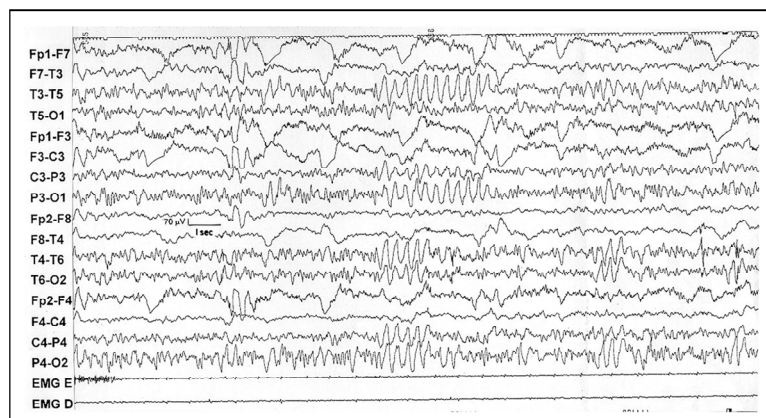
Fig 2. EEG showing OIRDA during hyperventilation.