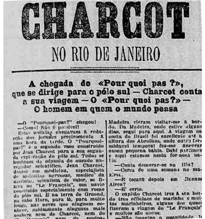
Figure 3. The Charcot Expedition – Rio de Janeiro, RJ, Brazil (Gazeta de Notícias, October, 13, 1908).

the Pourquoi Pas? The diary of the expedition to the South Pole was published as The voyage of the 'Pourquoi Pas?' in the Antarctic 7,8 . In this diary, Jean-Baptiste Charcot divided the trip into three parts: the first, covering the summer of