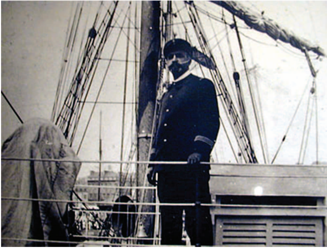
Figure 1. Jean-Baptiste Charcot (1867-1936).

onward journey to Buenos Aires. Commander Charcot and his crew were received by local authorities and left for Buenos Aires aboard the Français the same day. The newspaper Diário de Pernambuco , founded in 1825 and considered the first newspaper in continuous circulation in Latin America, published the news in its edition of October 20, 1903 (Figure 2) 9 .