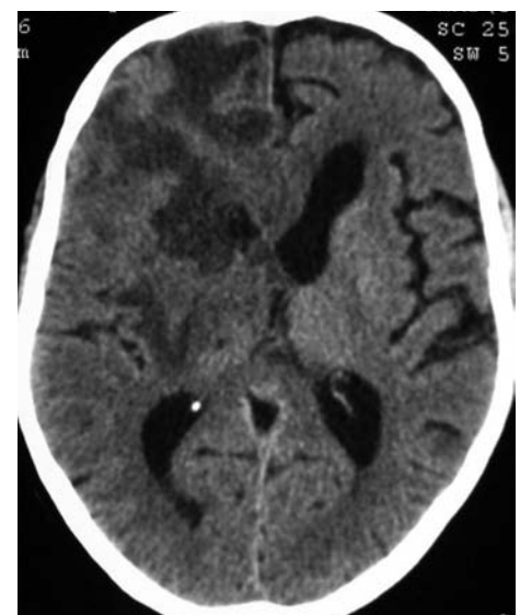
Fig 2. This head CT shows post-operative changes in deep white matter, extensive vasogenic edema, diffuse right sulci effacement, moderate right ventricular lateral compression and mild subfalcial herniation. No obvious new changes were observed.