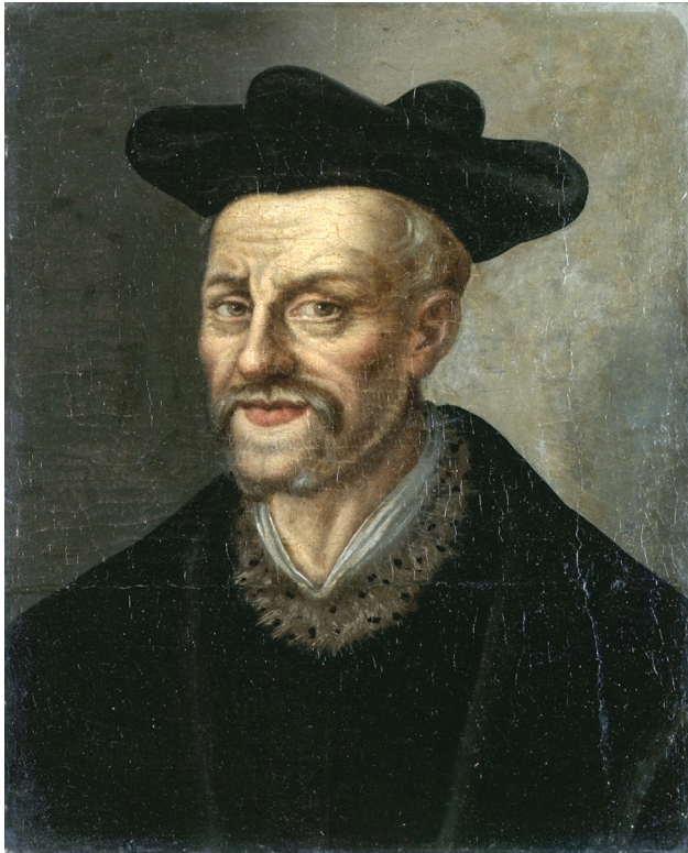
Figure 1 François Rabelais (1483?–1553). Licensed under a public domain mark.

The present paper reviews the contribution of Rabelais (→ Figure 1 ) to the origins of the term torticollis , one of the first phenomenological terminologies widely adopted to designate cervical dystonia.