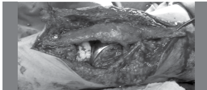
Figure 2. Allograft implanted in the tibia and fixed with screws.

maintained immobilized in extension for six weeks performing only isometric strengthening exercises and assisted passive range of motion gain. After the sixth week active exercises with progressive weight were allowed until the third month, when immobilization was discontinued.