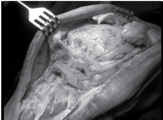
Figure 5. Appearance of case 2 after removal of the prosthesis and allograft without extensor mechanism.

patient and her family, we chose the transfemoral amputation as definitive treatment since there was no prospect of placing new prosthesis. After the amputation, it progressed well, with control of the infection and the patient is currently being followed up at our hospital by the Prosthetics/Amputees group.