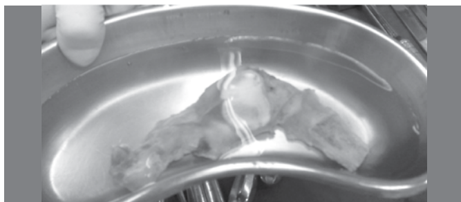
Figure 1. Extensor mechanism of the tissue bank, with the tibial insertion into the quadriceps tendon, including the patella.

allograft at the Institute of Orthopedics and Traumatology, Hospital das Clínicas, Faculdade de Medicina, Universidade de São Paulo (IOT-HC/FMUSP). The grafts were obtained from the Tissue Bank, Institute of Orthopedics and Traumatology, Hospital das Clínicas, Faculdade de Medicina, Universidade de São Paulo, a pioneer in our country. The cases are described below: (Figure 1)