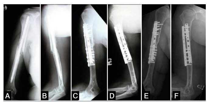
Figure 2. A) AP humerus view showing nonunion of a 54-year-old female patient, whose humerus diaphysial fracture was treated with intramedullary fixation B) Lateral humerus view showing nonunion C) AP humerus view of the patient on early postoperative period nonunion treated by fixation with double plates. D) Lateral humerus view of the patient on early postoperative period E) AP humerus view showing union on postoperative sixth month. F) Lateral humerus view showing union on postoperative sixth month.