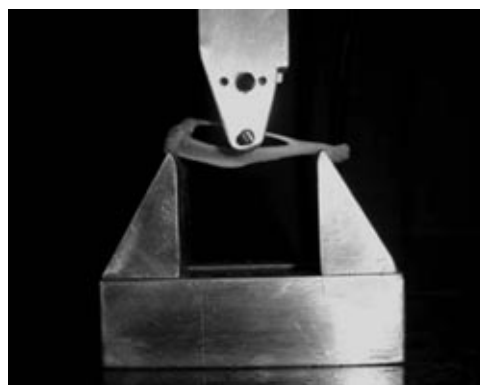
Figure 2 - Image of a tibia being submitted to flexion mechanical assay at 3 points.

of 0.31 m/s. Training was performed prior to surgery. At phase II, physical activity was applied in a spinning cage for 30 minutes, 5 days a week, during 9 weeks, with a speed of 0.31 m/s, beginning 24 hours after surgical procedure.