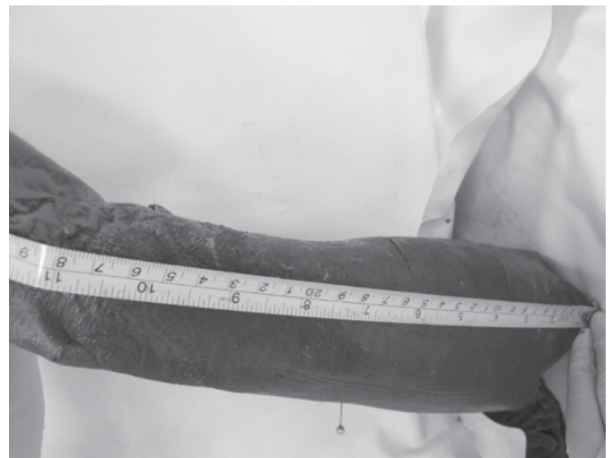
Figure 3. Limits used to measure the length of the tendon of the palmaris longus muscle.