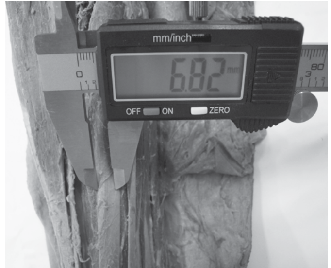
Figure 2. Limits used to measure the width of the tendon of the palmaris longus muscle.

It was observed that between the two sexes there is significant correlation between tendon length and forearm length ( r=0.53 ; p<0.01 ) and ( r=0.549 ; p<0.05 ), respectively. The tendon width does not present statistical significance. The mean length of the male group added to that of the female group was 119.9mm; with the groups separate, the means were 123.6mm and 111.4mm, respectively. In relation to the forearm length the