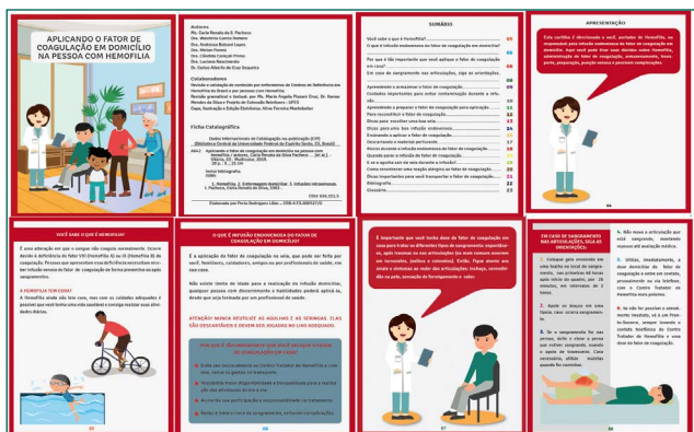
Figure 1. Pages of the final version of booklet “Aplicando o fator de coagulação em domicílio na pessoa com hemofilia”

distributed close to the edges of the material. To facilitate reading and ensure safety during medication preparation, a blank space in the infographic center was allocated, with the following measurements: 47 cm horizontally and 35 cm vertically. After constructing the text and selecting the corresponding figures, it was sent for layout by a graphic designer.