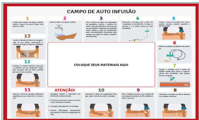
Figure 2. Final validated version of infographic “ Campo de autoinfusão ”

Infographic “ Campo de autoinfusão ” consists of coated printed material Polyvinyl Chloride (PVC), allowing it to be cleaned with disinfectants without damaging the images and texts. It presents the orientations arranged close to the edges of the material, in a numbered sequence, having the same initial measurements. Figure 2 represents the final version after assessment.