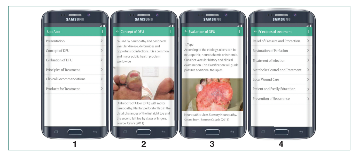
Figure 2. 1) Home Screen; 2) Concept of DFU; 3) Evaluation of DFU; 4) Principles of treatment;

The usability evaluation carried out by the Group G1 resulted in the detection of eight major problems and two minor problems. The major problems encountered were: the user is forced to