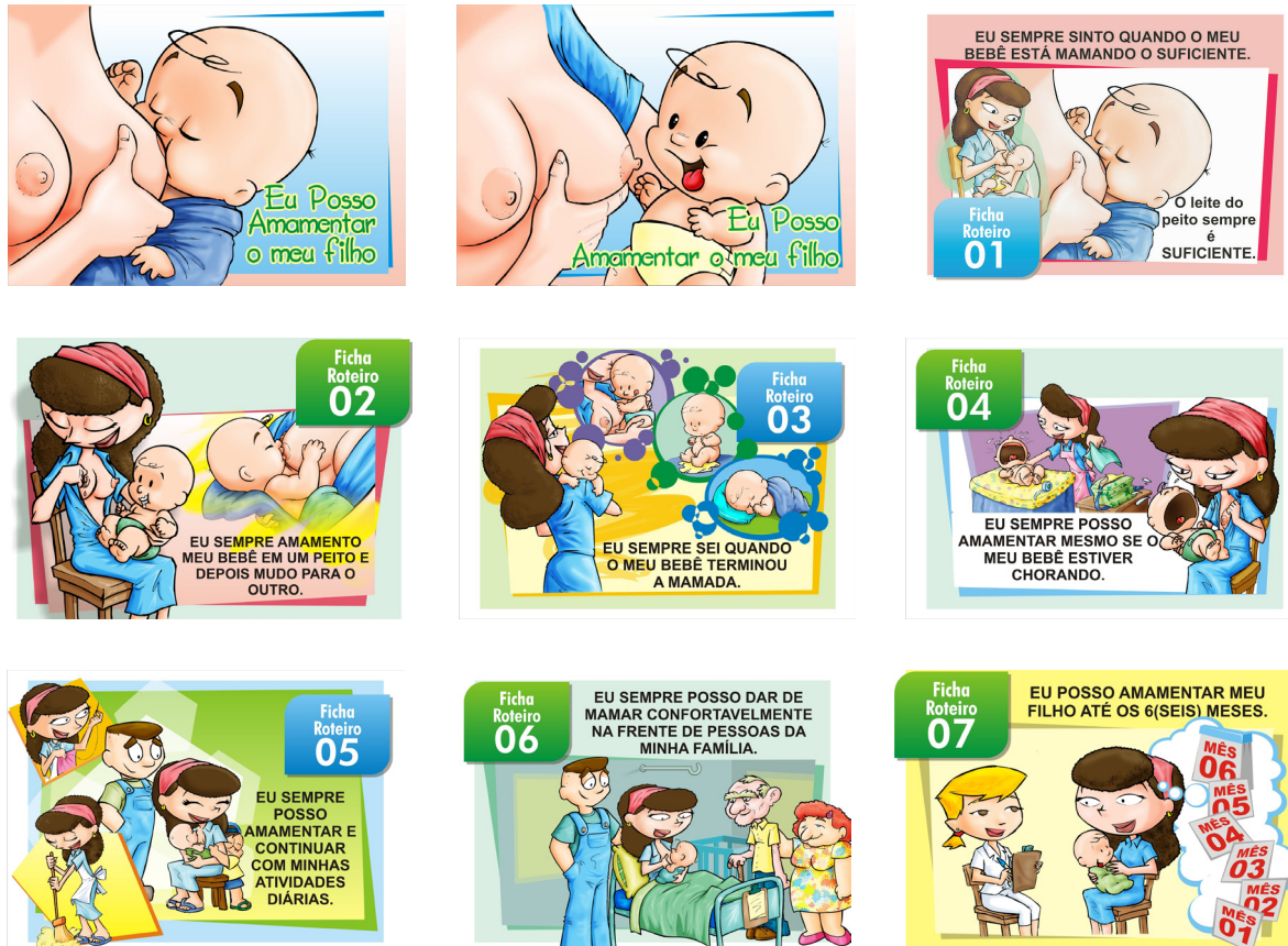
Figure 1. Initial version of the flipchart figures on breastfeeding self-efficacy that was presented to the expert judges.

The figures and scripts were catalogued by numerical order based on the sub-theme (Fi1, Fi2, Fi3, Fi4, Fi5, Fi6, and Fi7; S1, S2, S3, S4, S5, S6, and S7). In addition to the seven figures, two options for flip-chart covers were provided. Of the cover choices, the judges