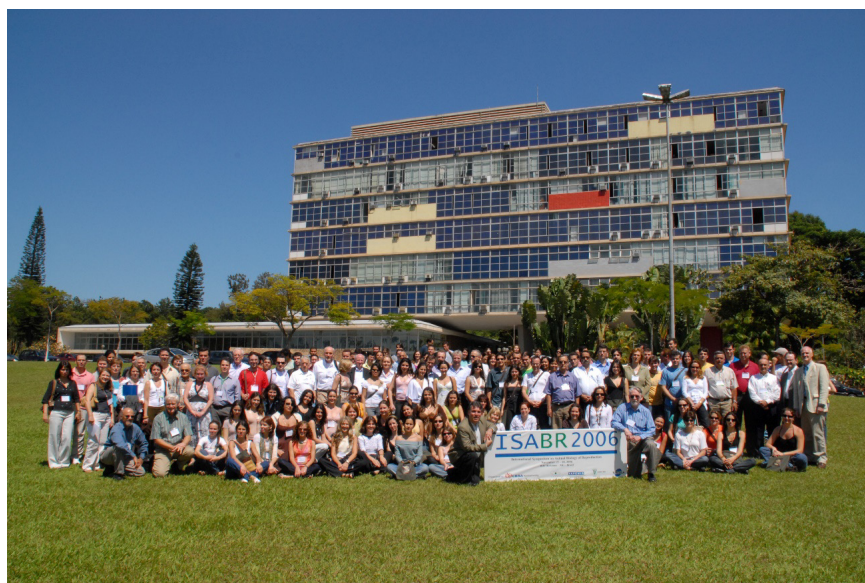
Figure 2. Participants of the first edition of the International Symposium on Animal Biology of Reproduction (ISABR), which took place at the Federal University of Minas Gerais (UFMG) campus, in November 15-18, 2006.