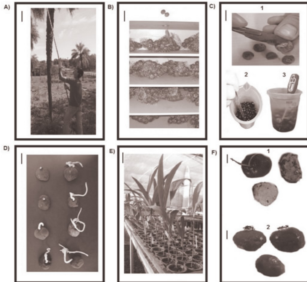
Figure 1. The harvesting, extraction, scarification and germination of macaw palm [ Acrocomia aculeata (Jacq.) Loddiges ex Mart.] seeds and seeds that died. A) Manual harvesting; bar=0.5 m. B) Drying in oven at 37^{\circ}\text{C} for 6 days; bar=30 cm. C) Mechanical scarification to remove the tegument in the hilum region (1), chemical scarification with concentrated sulfuric acid (2) and thermal scarification (3); bar=2 cm and beakers=600 mL. D) Germination and development of basic structures, such as shoots and primary roots, in seeds maintained in a germinator at 30^{\circ}\text{C} ; bar=1.5 cm. E) Emergence of seedlings; bar=5 cm. F) Microorganism damage to seeds maintained in the greenhouse (1) and seeds maintained in a germinator at 30^{\circ}\text{C} (2); bar = 1 cm.

Physically intact seeds were used to determine the effects of mechanical, thermal and chemical scarification compared to the control (no scarification). Mechanical scarification was performed with a scalpel, removing the tegument in the hilum region (Figure 1C-1). Thermal scarification was carried out by imbibing the seeds in hot or cold water. For scarification in hot water, water preheated to 98^{\circ}\text{C} was used. Scarification in cold water was performed at an initial temperature of 1.5^{\circ}\text{C} for two or four minutes (Figure 1C-3). The thermal scarification temperature was monitored, but it was not held constant. Chemical scarification was carried out using treatment with concentrated (98%) sulfuric acid for two or four minutes, followed by rinsing the seeds three times for one minute each in distilled water (Figure 1C-2).