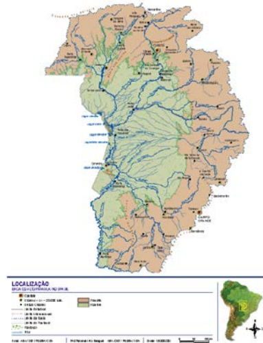
Figure 1. The geomorphological depression, in the center of South America, which is the Pantanal - lies at 60 and 150 meters above sea level, and the plateaus of its surroundings, varying from 200 to 1,000 meters in height, where the springs of the rivers that seasonally supply the floodplain are found.