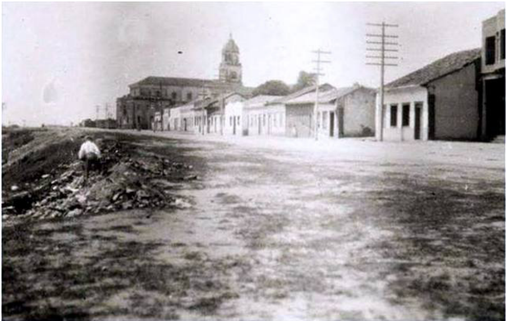
Figure 2 –São José Street following the expropriation, 1939-1940.

The following year, an Institutional Act, claimed by the local newspaper, Correio Joseense , to be an extremely urgent action, increased the number of houses to be demolished (SÃO JOSÉ DOS CAMPOS, 1939). On the sanitary engineer's drafting table the "sea" gained its "seafront"; the landscape acquired scenic value, framing and embellishing the surroundings that the urbanistic plan wished to make esthetically and symbolically urban (Figure 2).