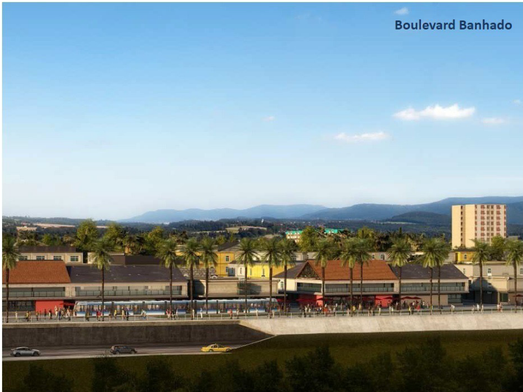
Figure 5 – Banhado Boulevard (Project).