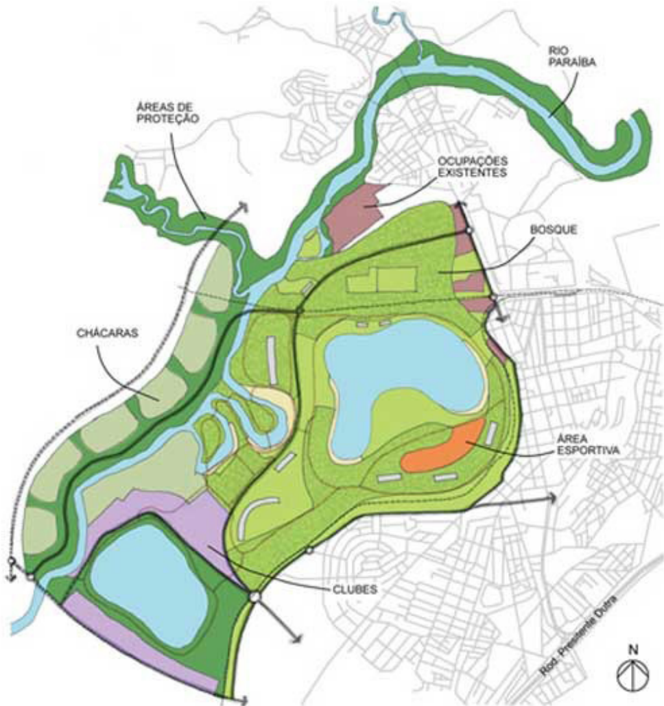
Figure 3 – Banhado Regional Park Project