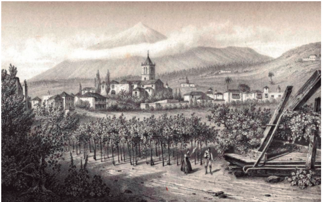
Figure 2. Malvasía vineyards on high trellises (recorded by J. J. Williams, 1836).

The importance of communal easement use of public forest for the poorest population ended affirming the popular belief that public forest was “the heritage of the poor”. Thus the difference in terminology: council officers referred to the “montes de propios” as mountains of council , whereas peasants considered it royal mountains as a gesture of royal magnanimity with the poorest.