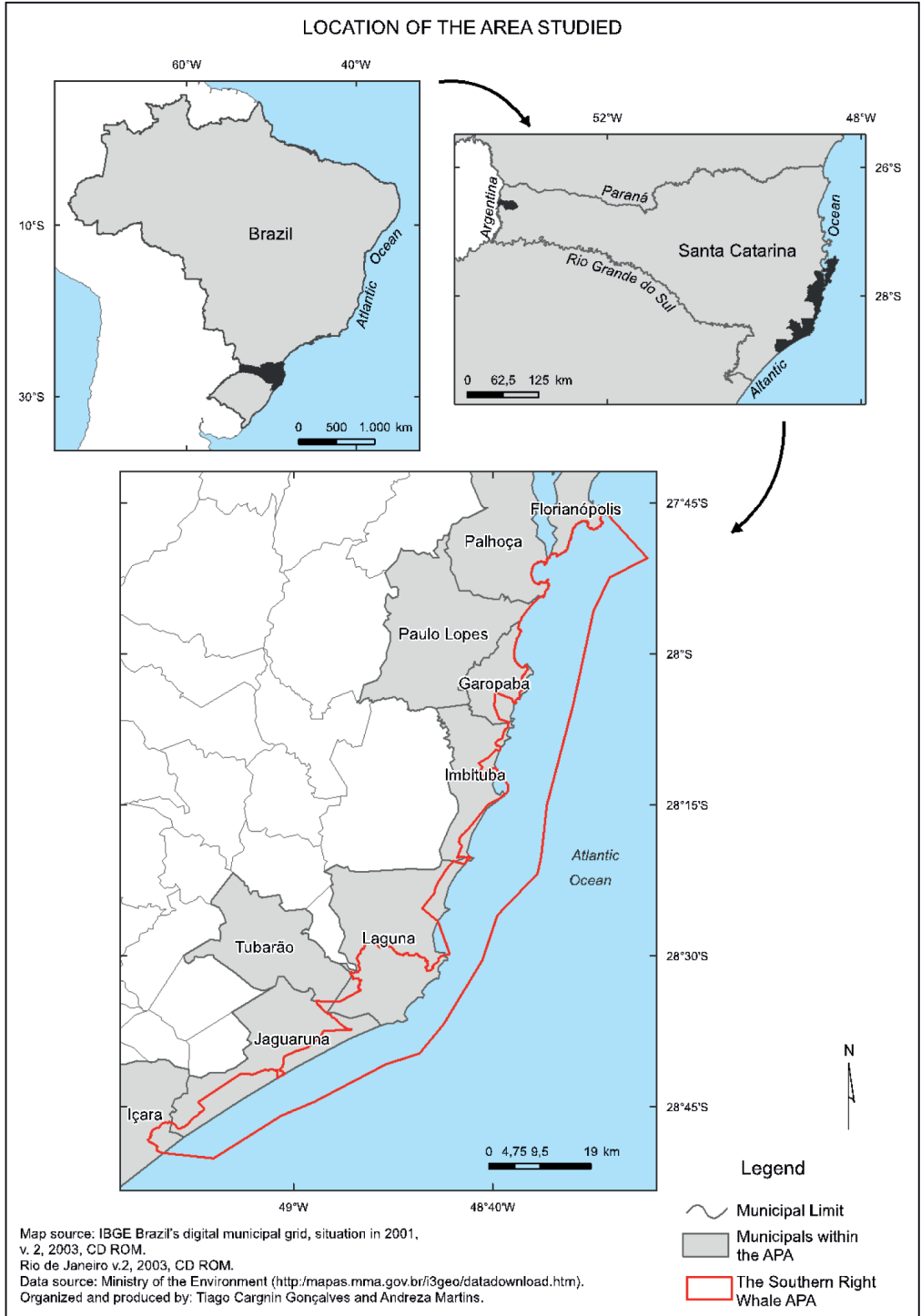
Map 1. Site of the Southern Right Whale APA