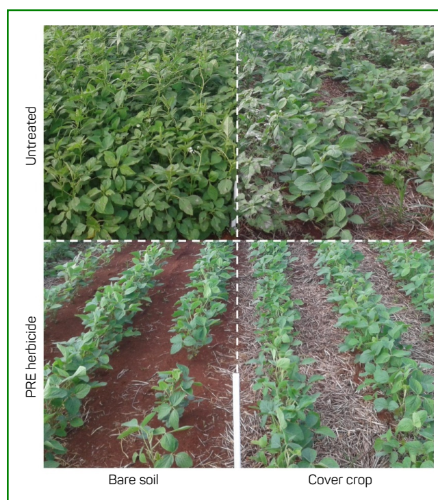
Figure 2 - Control of A. viridis with PRE herbicides and cover crop prior to soybean planting

The most common modes of action that are used for Amaranthus management in PRE are ALS, PSII, HPPD, PPO, VLCFA, and microtubule inhibitors. Although resistance to those modes of action have been reported in Amaranthus , many of them are still effective on several populations, and therefore, are widely used worldwide. We compiled examples of herbicides within the most common modes of action that are recommended for Amaranthus control in PRE and their respective efficacy levels on A. hybridus , A. palmeri , A. retroflexus , and A. viridis (Table 3).