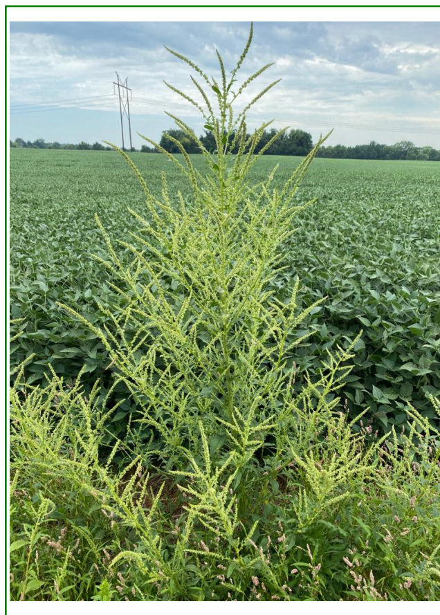
Figure 1 - Late stage Amaranthus tuberculatus plants have multiple growing points, which makes them more difficult to control with herbicides that need to translocate to these areas in order to provide full control

Herbicide resistance in Amaranthus is extremely concerning. To date, Amaranthus species have evolved resistance to most herbicide modes of action with broadleaf activity (Table 2). The first case of herbicide