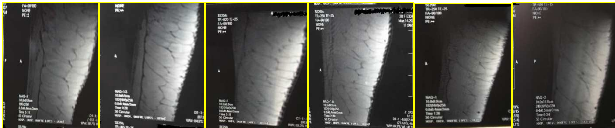
Figure 2 - Sagittal plane T1-weighted pre and post-treatment images of patients 1, 2 and 3.

subcutaneous fat tissue. Patient 3, however, showed a slight thickness increase in this layer, likely due to the weight gain recorded at the end of the treatment (Figure 2).