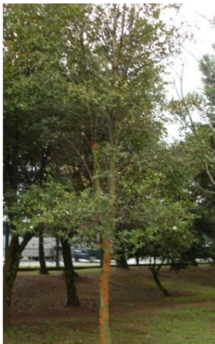
Figure 1. Eugenia pyriformis Cambess.