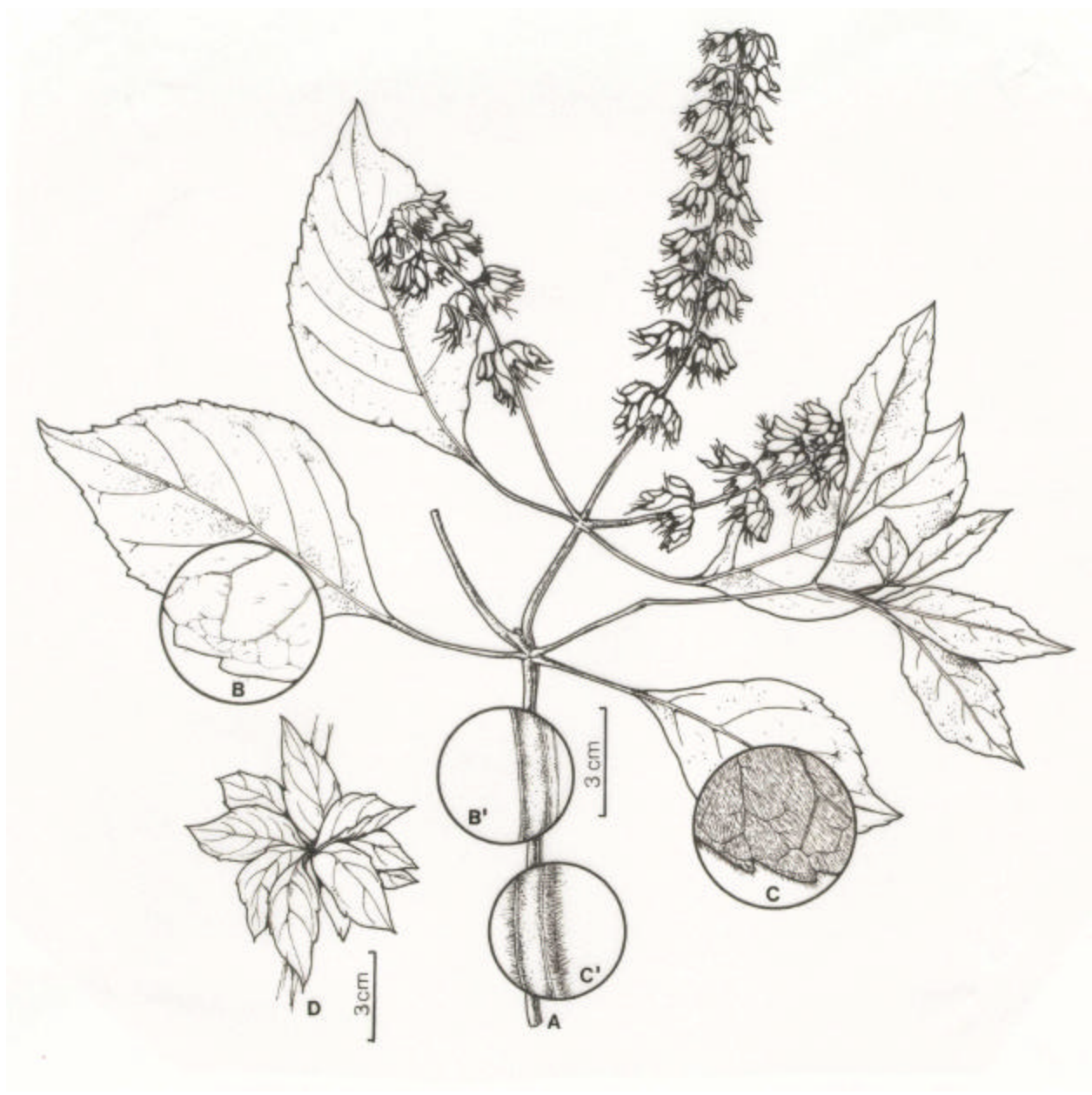
Fig. 4. Ocimum campechianum Mill. A, habit; Leaf (B) and stem (B') indument of the var. campechianum ; Leaf (C) and stem (C') indument of the var. pubescens (Drawn adapted from Albuquerque & Andrade, 1998a); D, Leaf arrangement of the var. congestifolium .