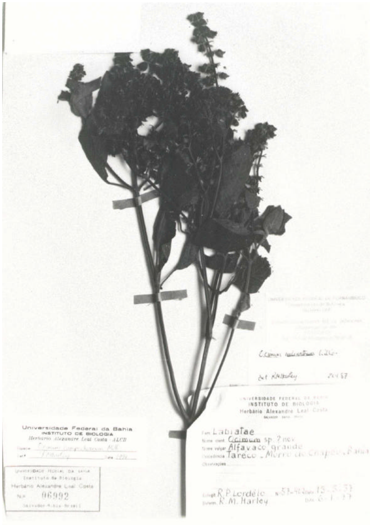
Fig. 2. Ocimum campechianum var. pubescens Albuquerque var. nov. (Holotypus ALCB).